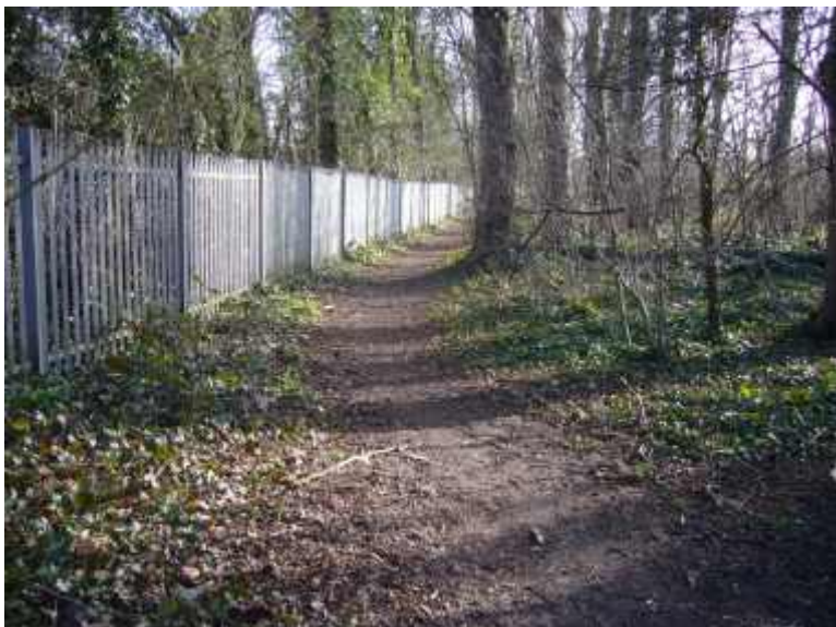
looking south towards station